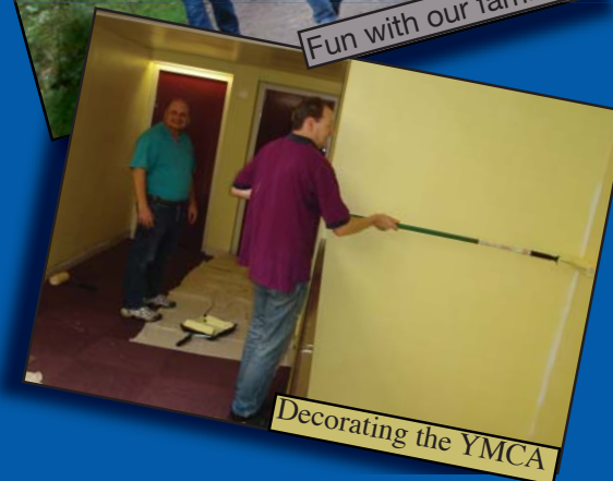
Decorating the YMCA