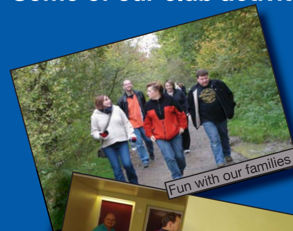
Fun with our families